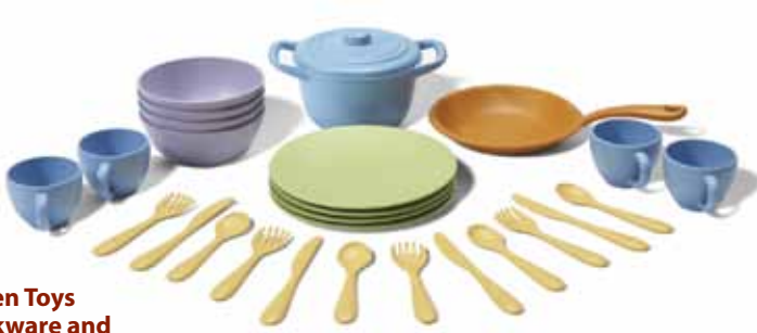
Green Toys cookware and dining set