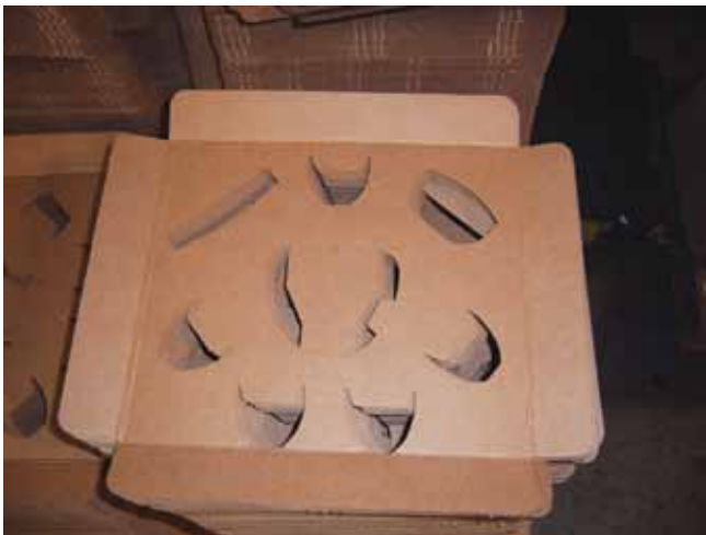
Green Toys packaging design

A third-party logistics company, Orion Logistics, based in Hayward, California, provides “pick and pack” services to Green Toys Inc. A “pick and pack” service means that Orion Logistics stores Green Toys Inc. products, keeping an inventory of what is in the warehouse so they can fill and ship orders as needed. In addition, Orion Logistics is experienced at meeting the shipping requirements of different retailers. For example, an order from a large retailer may have very specific pallet shipping requirements whereas a small order from a specialty toy store may not.