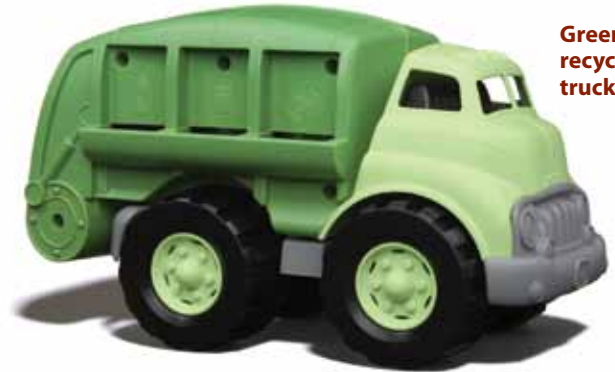
Green Toys recycling truck

Our long-term vision is to turn the industry upside down and have people think differently. Our goal is to have people look at toys like they look at food—to think about how the ingredients of toys may affect their everyday lives.