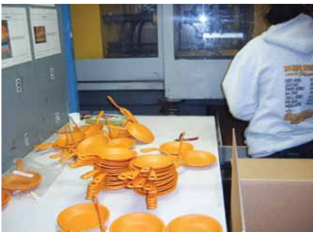
Manufacturing Green Toys

An in-depth health and safety evaluation was not conducted for this case study. A walk through of the plastic manufacturing plant found the plant to be clean and workers wearing safety glasses and other protective equipment. Because the design of Green Toys Inc. avoids hazardous materials, workers are not exposed to these substances in the production process.