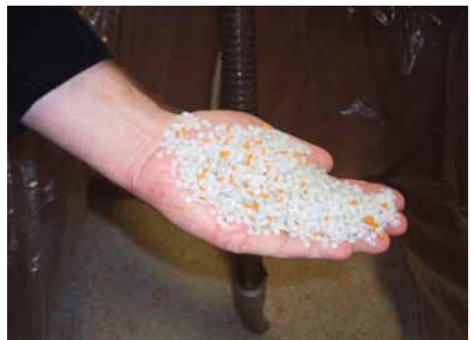
Plastic pellets mixed with colorant